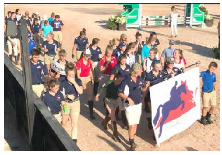
Opening ceremonies at the USPC Championships in Tryon, NC this summer. The Virginia Regional Pony Club sent 40 members to compete.