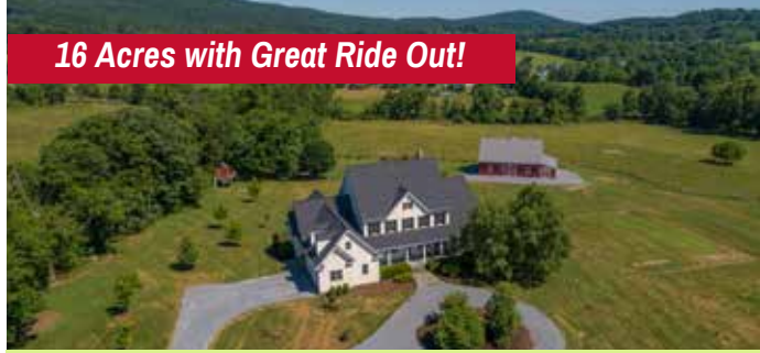
14545 Shadowbrook Ln, Purcellville $975,000

Custom built "New Old House" in private & breathtaking setting w/ views of the Blue Ridge & Short Hill Mountains. Hillsboro & downtown Purcellville are minutes away. Main Floor Master Suite & additional 4 beds, den & loft on upper level. Hand built board & batten (poplar) barn w/ 4 stalls, tack room & party loft is truly a work of art!